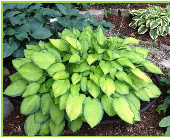
H. Gold Standard

'Gold Standard' Yellow centered plant that once was also a "must have".