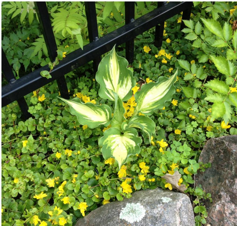
H. Lakeside Paisley Print

There are 8,000+/- registered hostas. You can find a listing for each and every registered hosta at hostaregistrar.org . If you search for a specific hosta, you will get a general description of that hosta. If you click on the name again, you will get a more detailed report. Sometimes (unfortunately not always) you will get the growth rate. This is something that I like to check. Some hostas are pokey-slow. I have to really love the look of a particular hosta if I am to purchase a slow growing hosta, and be prepared to wait five, six, ten years, before it shows any signs of glory. "Beach Boy" and "Lakeside Paisley Print" are incredibly slow, but I had to have them. I've had my "L. Paisley Print" for 4 years now and it's still a single eye and small. To be honest, I don't know anyone that has a good-sized specimen. "Beach Boy" has fared somewhat better. It, too, is 4 years old, and this year, I gotta say, the leaves looked spectacular.