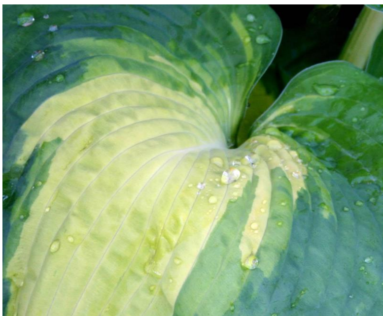
H. Great Expectations

I have owned a tremendous specimen of "Great Expectations" for years. Most gardeners lament the ownership of this hosta, because it can be picky. It needs the right amount of moisture and light to thrive. Anyway, the drought last year killed it. Or so I thought. I couldn't believe my eyes this year when I see a little baby coming up in mid-July. It's still a little baby, but at least it's there.