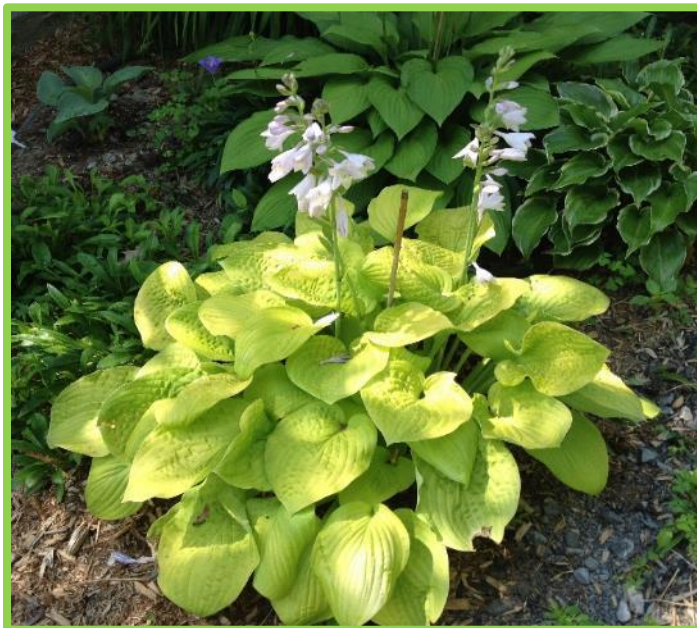
H. August Moon

'August Moon' Large hosta with bright color and attractive flowers. Best of the early gold hostas.