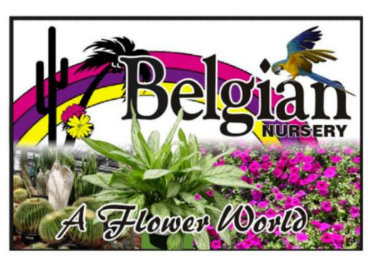
Plants and People Need Each Other

136 County Rd 4, Donwood / Peterborough, ON